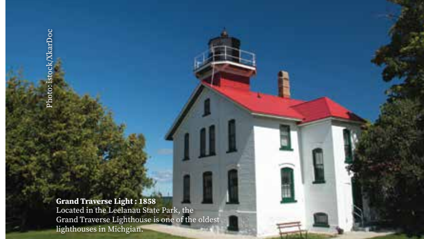
Grand Traverse Light : 1858 Located in the Leelanau State Park, the Grand Traverse Lighthouse is one of the oldest lighthouses in Michigan.