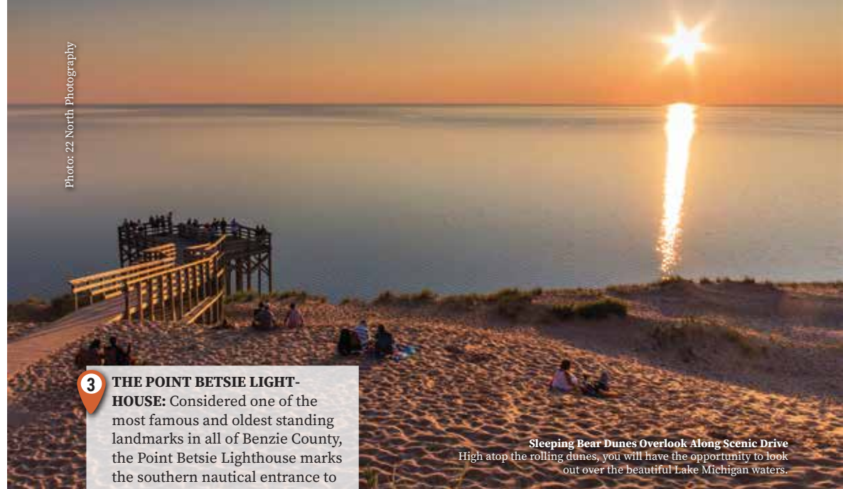
Sleeping Bear Dunes Overlook Along Scenic Drive High atop the rolling dunes, you will have the opportunity to look out over the beautiful Lake Michigan waters.

3 THE POINT BETSIE LIGHTHOUSE: Considered one of the most famous and oldest standing landmarks in all of Benzie County, the Point Betsie Lighthouse marks the southern nautical entrance to the Manitou Passage. It was built in 1858 and may be toured on Saturdays and Sundays from Memorial Day to Columbus Day in the early afternoons.