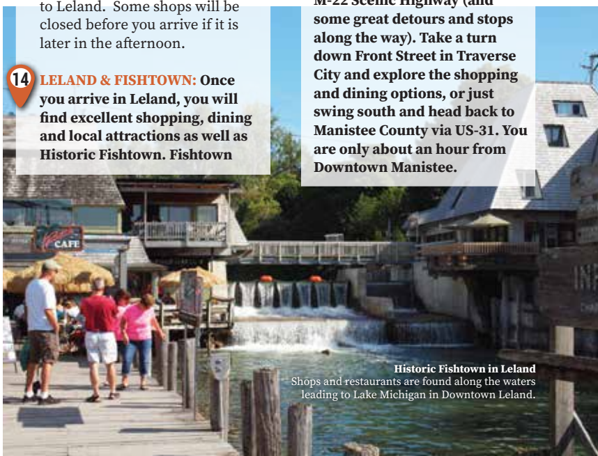
Historic Fishtown in Leland Shops and restaurants are found along the waters leading to Lake Michigan in Downtown Leland.

RETURN TO MANISTEE COUNTY: You have just traversed all of the 116 mile M-22 Scenic Highway (and some great detours and stops along the way). Take a turn down Front Street in Traverse City and explore the shopping and dining options, or just swing south and head back to Manistee County via US-31. You are only about an hour from Downtown Manistee.