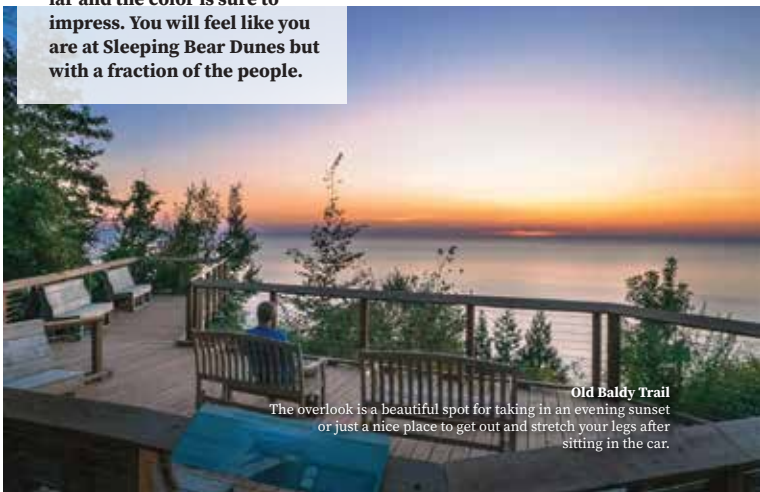
Old Baldy Trail The overlook is a beautiful spot for taking in an evening sunset or just a nice place to get out and stretch your legs after sitting in the car.

11 OLD BALDY UNIVERSAL ACCESS TRAIL TO THE BLUFF This universally accessible trail is about 0.5 miles and will take you to the overlook (pictured here). All skill levels are encouraged to experience this incredible trail. If you have more time, and are up to the challenge, hike the complete trail to the Old Baldy Dune. This will take about 2 hours to hike out and back. The trails leading up to the overlook are spectacular and the color is sure to impress. You will feel like you are at Sleeping Bear Dunes but with a fraction of the people.