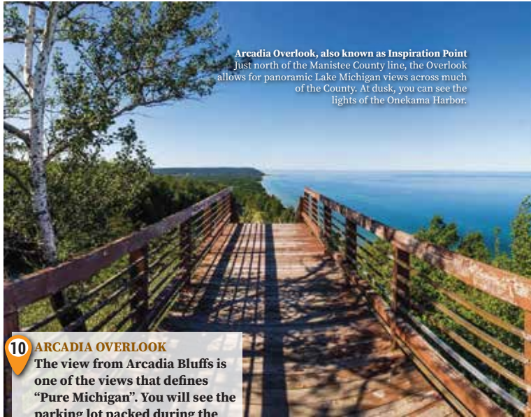
Arcadia Overlook, also known as Inspiration Point Just north of the Manistee County line, the Overlook allows for panoramic Lake Michigan views across much of the County. At dusk, you can see the lights of the Onekama Harbor.

Daily Specials, Broasted Chicken, Homemade Soups, Pizza, Subs and more plus Full Bar, Beer & Wine. Casual, family-and-friends atmosphere.