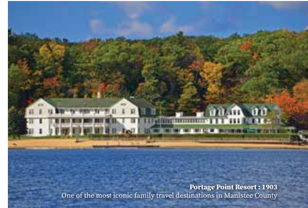
Portage Point Resort: 1903 One of the most iconic family travel destinations in Manistee County

6 ARTESIAN WELL ON PORTAGE POINT DRIVE Explore Portage Lake and Lake Michigan from this beautiful spot. Also check out the Artesian well along Portage Point Drive on your way to the Inn, or back towards M-22. It is about .25 miles down the road on the south side from the intersection of M-22 and Portage Point Drive. It contains some of the freshest spring-fed water you will find in Michigan.